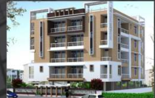
Vasundhara, Civil lines, Jaipur