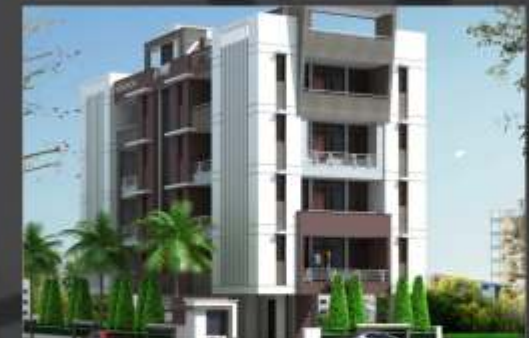
Om Enclave, Janta Colony, Jaipur