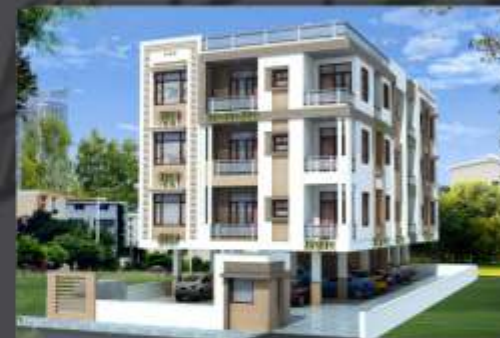
Chandraprabha, C-scheme, Jaipur