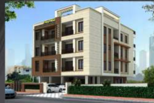
Kripa Residency, Adharsh Nagar, Jaipur